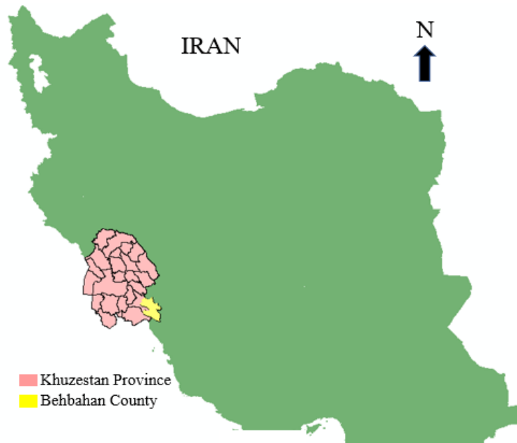
Figure 1. Location of Behbahan county in southwest Iran